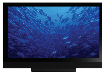
LCD and PDP Flat Panel Display