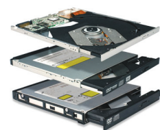
Optical Disk Drive